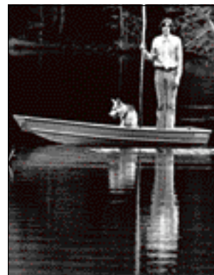
James Taylor Posing for the "One Man Dog" album cover at the Tree Frog Farm in Vermont, fall 1972.