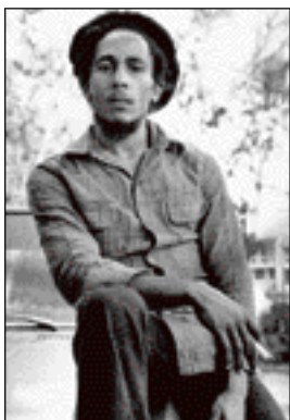
Bob Marley on his BMW, Jamaica, 1976.