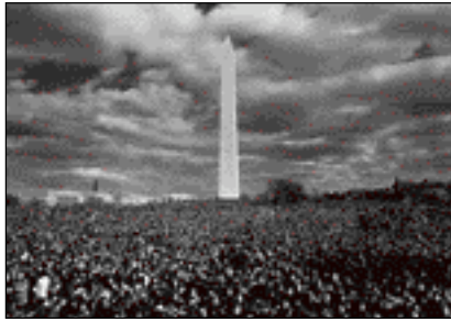
The Moratorium Peace Rally, Washington D.C., 1969.