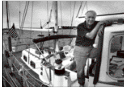
Walter Cronkite gets ready for a sail aboard his beloved boat, Wynije, 1989.