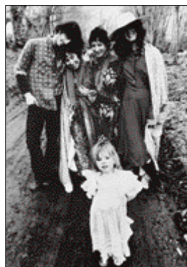
Day tripping at Vermont Commune, 1970.