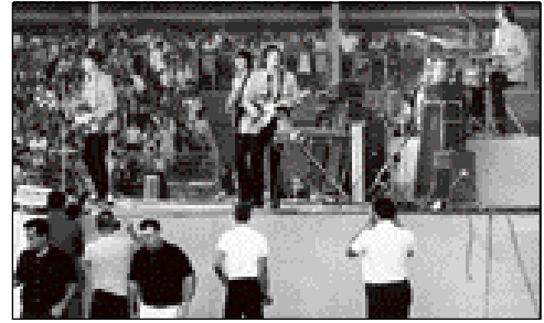
The Beatles at Shea, 1965.