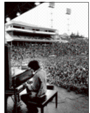
Bob Dylan on solo piano plays to a packed crowd at Kezar Stadium in San Francisco, 1975.