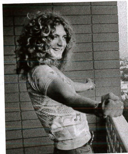
Robert Plant – Led Zeppelin