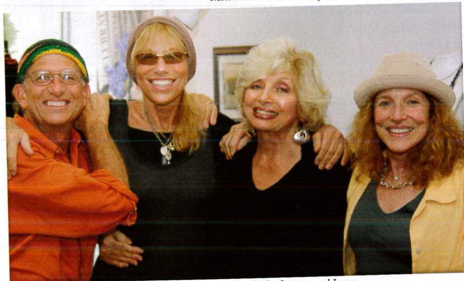
A rare appearance of the entire Simon siblings: Peter, Carly, Joanna and Lucy